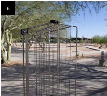
Carlton Bradford, Doublewide