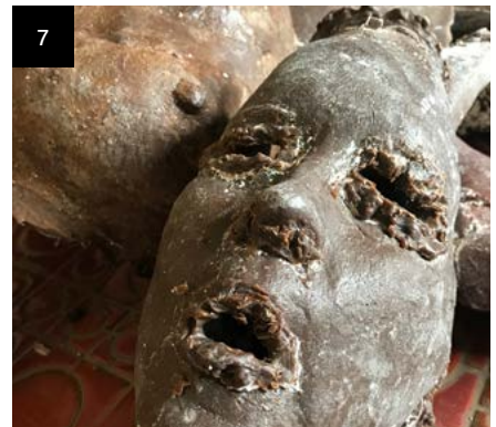
Piper Bast, Persephone's Memory