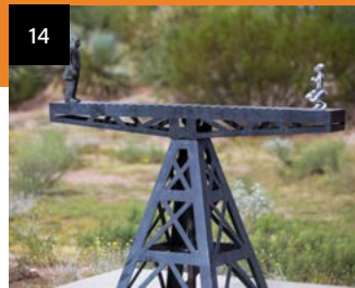
Joe Dal Pra, Control and Obsession 2